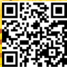
RDP Facebook Page